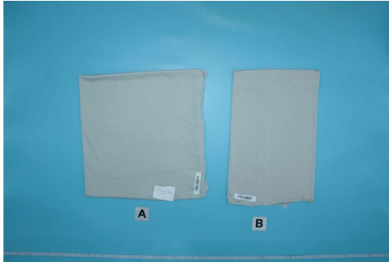
From left to right Sample: (A)SILVER;(B)SILVER